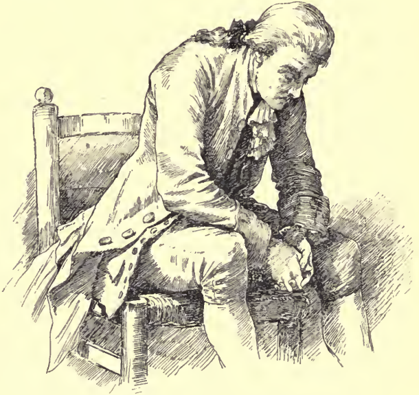
'He would sit motionless and stupefied.'

feeling was exhausted; and he would sit motionless and stupefied till he was wakened again from this suspension of thought and sensation by some moan of the poor man, or some delirious startings. Toward morning the wounded man lay easier; and as Ormond was stooping over his bed to see whether he was asleep, Moriarty opened his eyes, and fixing them on Ormond, said, in broken sentences, but so as very distinctly to be heard—